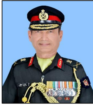
LT GEN NEERAJ VARSHNEY, VSM